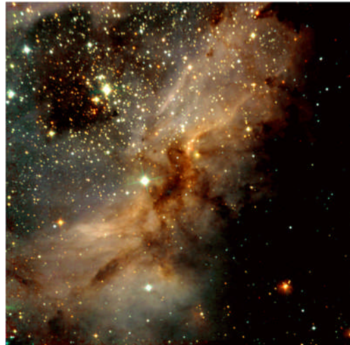
Stellar Nursery in M17 (NTT+SOFI)

The subject of elemental unity is one that concerns all who are looking for answers to ultimate questions and believe, as I do, that through both the study of science and sacred scripture we may find guidance to that end.